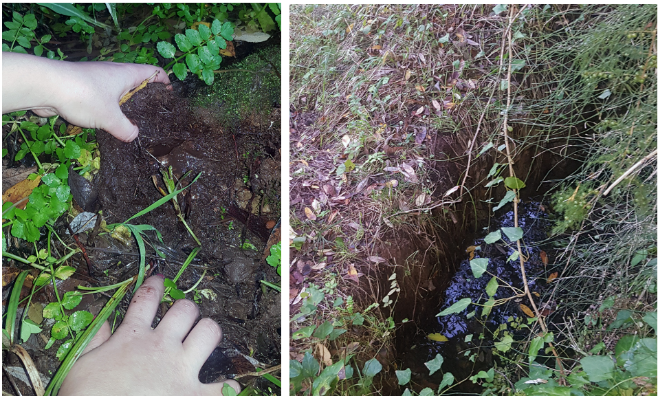
Fig. 1. Sampling habitat of Pseudamnicola thawintae sp. n.

Type material: holotype: 2.75 mm high and 1.8 mm broad, ZMH 140882. Paratypes: 30 specimens from type locality: 3 sp. ZMH 140883, 14 in coll. Glöer, 13 in coll. Sadouk. Type locality: Tizi-Ouzou region (North-central part of Algeria), 36°30'21" N 4°02'28"E, at an altitude of 720 m.