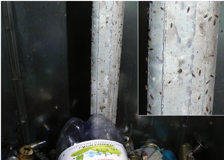
Fig. 3. Drosophilids inside a recycling bin in a highway rest area.

Drosophilids are relatively weak flyers, especially compared to some invasive pests (e.g. Harmonia axyridis Pallas, 1773), however, SWD's rate of