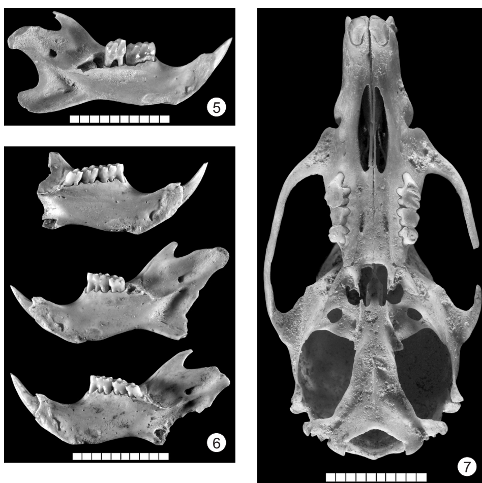
Figs 5–7. 5 = Lingual side of mandible of the black rat from the site of Budapest, District III, 139 Szentendrei Road. Aquincum (Roman Period); 6 = Mandibles of black rats from the site of Remetehegy rockshelter (Medieval Period); 7 = Skull (ventral view) of a black rat from excavations at Buda Castle (Medieval period). Scale bars 10 mm

There is only one site from the Middle Ages with small mammal material: the site of “Budapest District XI., Kőérberek, Tóváros-lakópark” analyzed by this au-