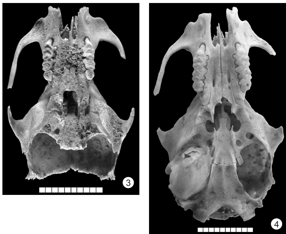
Figs 3–4. Skull (ventral view) of one of the black rats from site: 3 = Budapest, District XVII, Péceli Road (Roman Period); 4 = Dusnok–Szúnyogosi dűlő (Roman Period). Scale bars 10 mm

So far, black rat remains from Waltersdorf (Eastern Germany) represent the only data known from outside the territory of the Roman Empire in Europe (TEICHERT 1985) (Fig. 2). The two new records from Hungary outside the limes lay