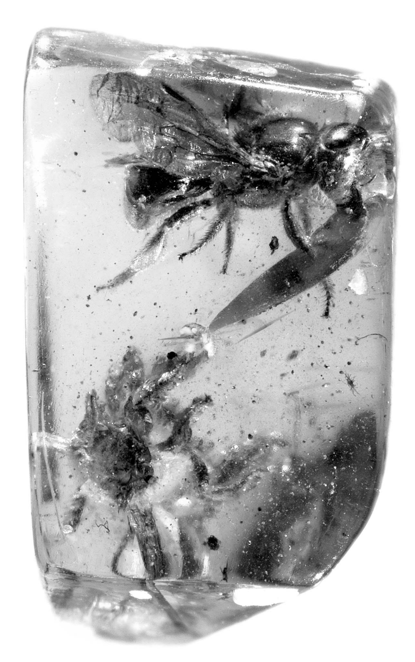
Fig. 1. Photomicrograph of entire amber piece containing holotype (uppermost specimen) and paratype (lower specimen largely covered by fractures and some Schimmel, seen end on) of Ctenoplect rella\ gorskii\ {\rm sp.\ n.\ Entire\ piece\ has\ a\ length\ of\ } ca.\ 8.9\ {\rm mm.}