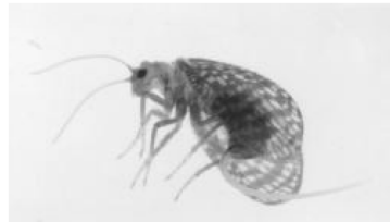
Femmina adulta